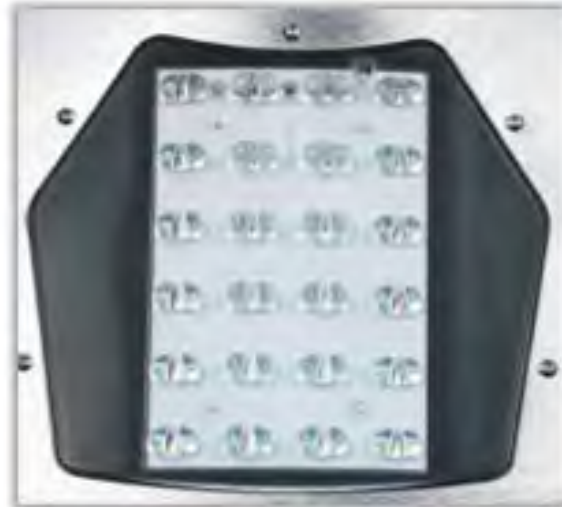
High Efficiency LED Chip