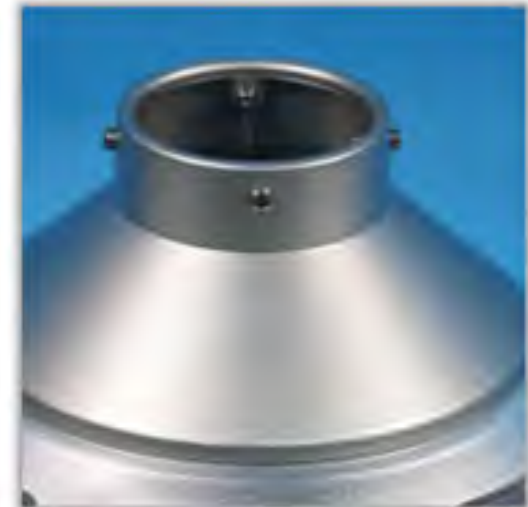
Anodic Oxidation Process Aluminum Alloy Case